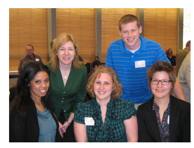
MSU RCPD Awards, April 23, 2010