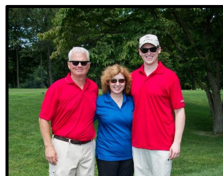
Kara Tagget Open 2015