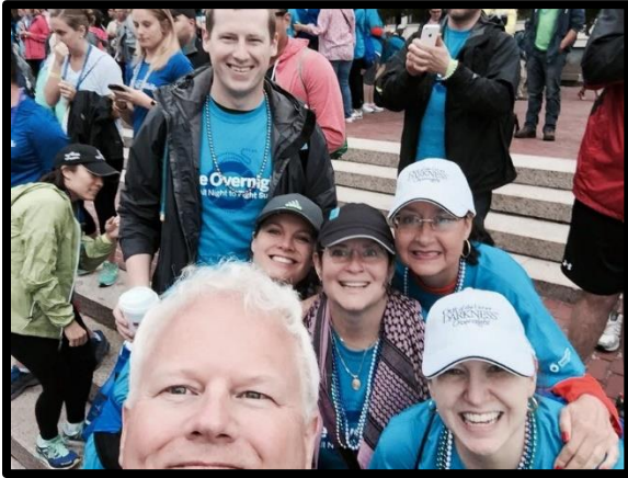
AFSP OOTD Walk Boston, 2015

Most suicidal people are not psychotic or insane, they are usually upset, grief stricken, depressed or despairing. Suicide is preventable, 90% of those who die by suicide have a diagnosable and treatable psychiatric disorder at the time of their death. The CDC estimates 10% of the U.S. population has suffered major depression within the past year, at an estimated 311 million people in the US, that is 31 million people who have suffered major depression. One in four has a diagnosable and treatable mental health condition but only 25% seek help. Worldwide, over 1 million people die by suicide annually and that number is thought to be low. A death due to suicide is not always reported as a suicide due to the stigma associated with suicide. An estimated 1 million people in the U.S. survive a suicide attempt, and that number is low too as many attempts go unreported. Mental illness and suicide does not discriminate; it can happen to anyone regardless of gender, race, age, religion, or socio economic standing. We are all at risk. Surely the risk of mental illness and suicide to all of us warrants awareness, education, and treatment at least comparable to other illnesses such as breast cancer.