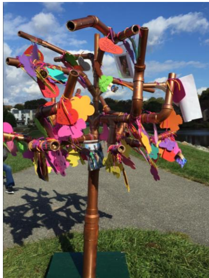
Tree of Life OOTD Community Walk Columbia, 2015