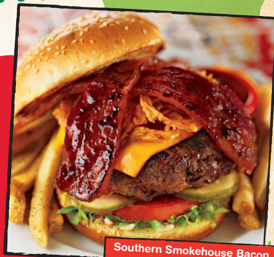
Southern Smokehouse Bacon Big Mouth Burger®